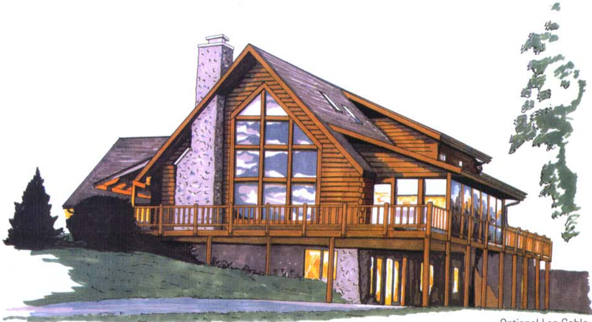
Optional Log Gable